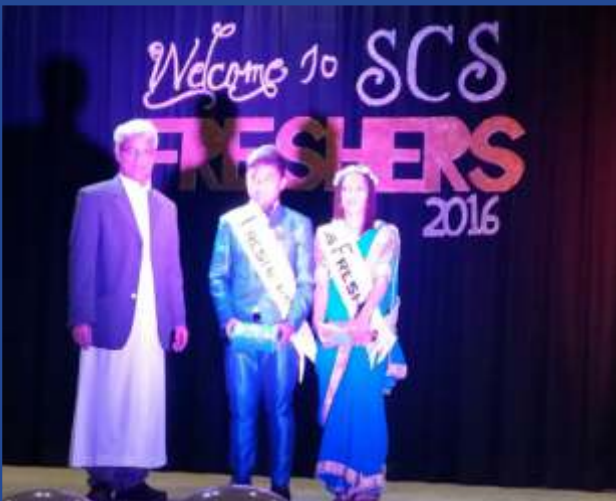
Salesian College Sonoda celebrated the fresher's day on 6th August 2016